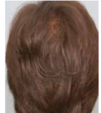
AFTER 3 treatments RegenACR Classic / Extra