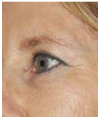
AFTER 3 treatments RegenACR Plus